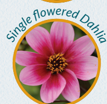
Single flowered Dahlia